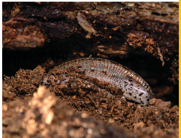
Lizard partially exposed during hibernation

The lizard is a cold blooded animal and live in all parts of the world. The lizard that lives in the cold, snowy areas must do something to keep warm during the winter. Because they cannot regulate their body temperature on their own, and require help from the environment, the lizard will hide under ground or a tree during the winter. During this time they will enter a state of dormancy called brumation or hibernation.